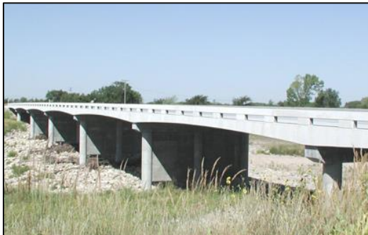
Bridge Replacement Alternative Sample depiction (not actual design)

The bridge replacement alternative would include the construction of a new 2-lane bridge, improvement of the alignment and approaches, and resolving erosion issues.