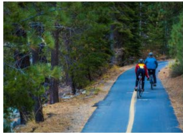
PLACER COUNTY PARKS & TRAILS PLAN