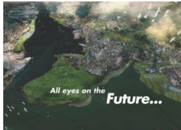
VANCOUVER PARKS AND RECREATION PLAN (VanPlay)