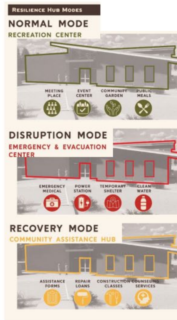
MARIPOSA COUNTY RECREATION & RESILIENCY PLAN