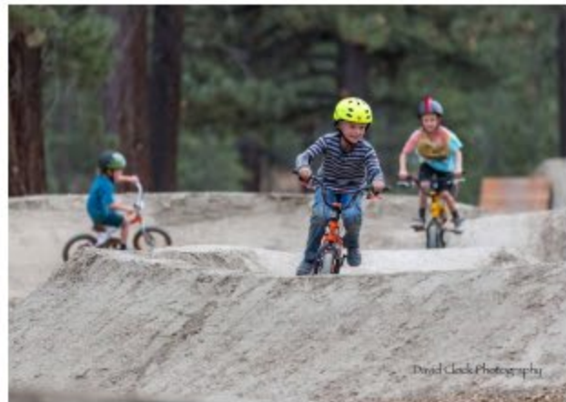
BIJOU BIKE PARK