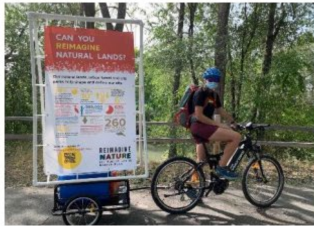
SALT LAKE CITY PUBLIC LANDS & TRAILS PLAN