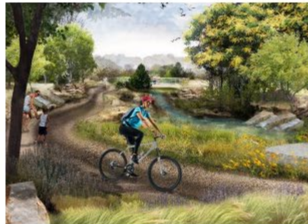
LOUDOUN COUNTY TRAILS PLAN